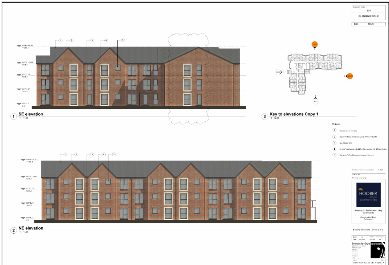
Fig C: Proposed retirement living apartments.