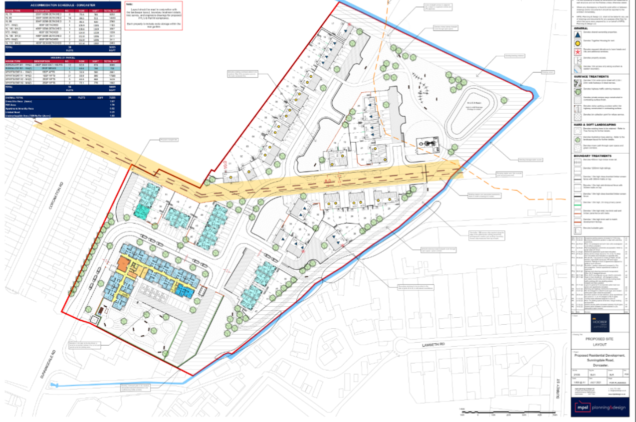
Fig A: Proposed site layout.