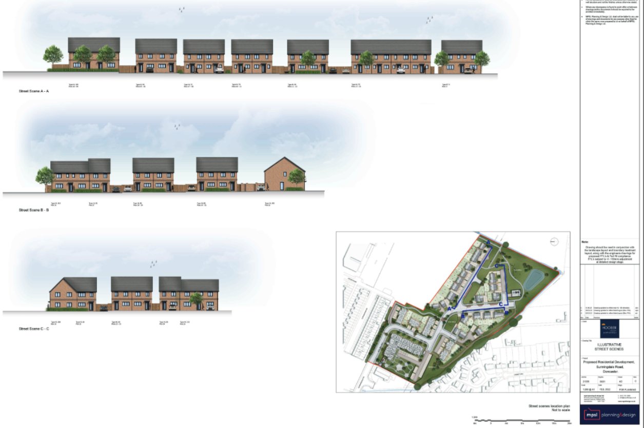
Fig B: Proposed street scenes.